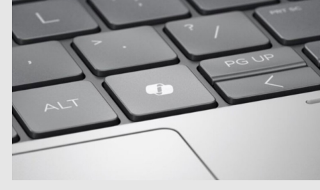
Microsoft Copilot key<sup>30</sup>

This PC contains at least 50% post-consumer recycled plastic in the keycaps<sup>8</sup> and provides power data tracking and suggestions to reduce energy use representing the latest in responsible design from HP.9